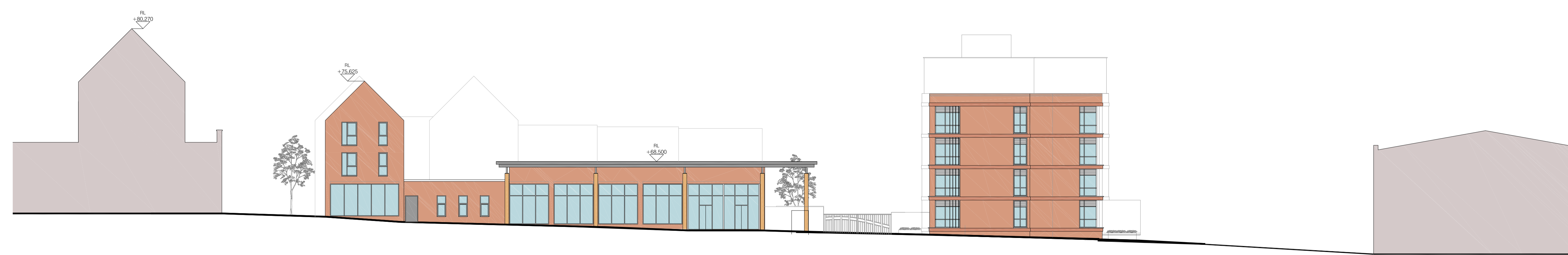
WEST ELEVATION 4-4

Notes All dimensions to be verified on site. Do not scale this drawing. All discrepancies to be clarified with project architect. This drawing is the property of Benoy Architects and is issued on the condition it is not reproduced, related or disclosed to any unauthorized person, either wholly or in part without written consent of Benoy Ltd. Ordnance Survey material is used with the permission of The Controller of HMSO, Crown copyright AP 129875. The CDM hazard management procedures for the Benoy aspects of the design of this project are to be found on the "Benoy - Designer's Hazard Identification and Management Sheet" and/or drawings. The full project design team comprehensive set of hazard management procedures are available from the Planning Supervisor/Safety Coordinator appointed for the project.