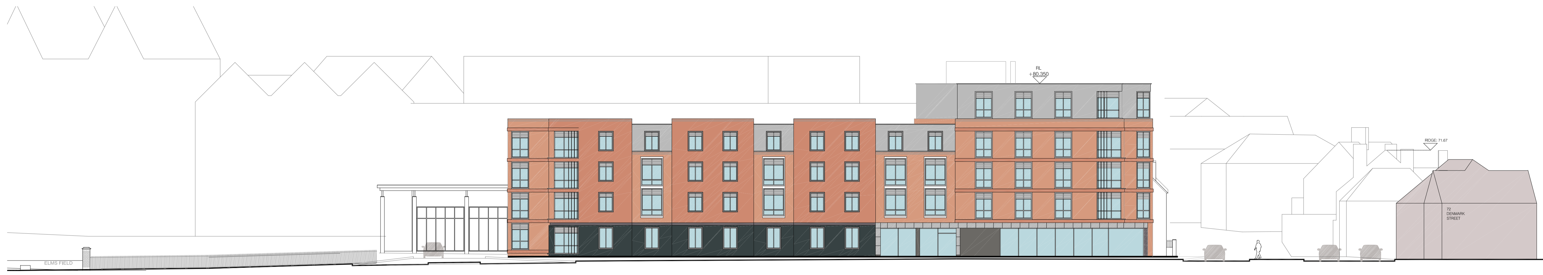
SOUTH ELEVATION 1-1