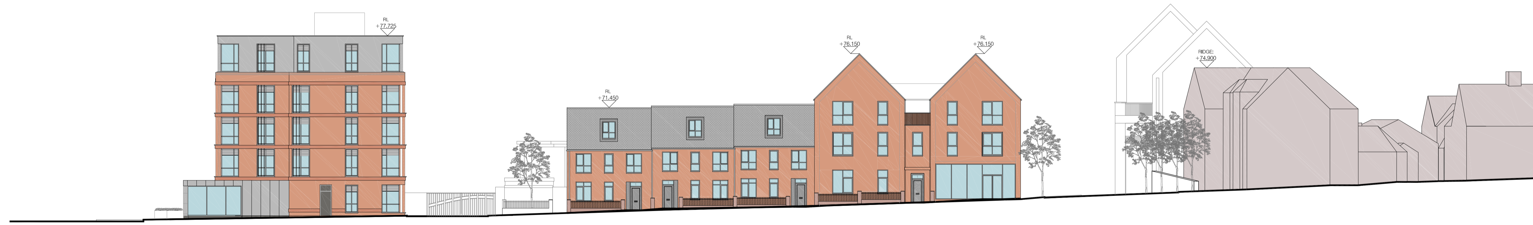
EAST ELEVATION 3-3