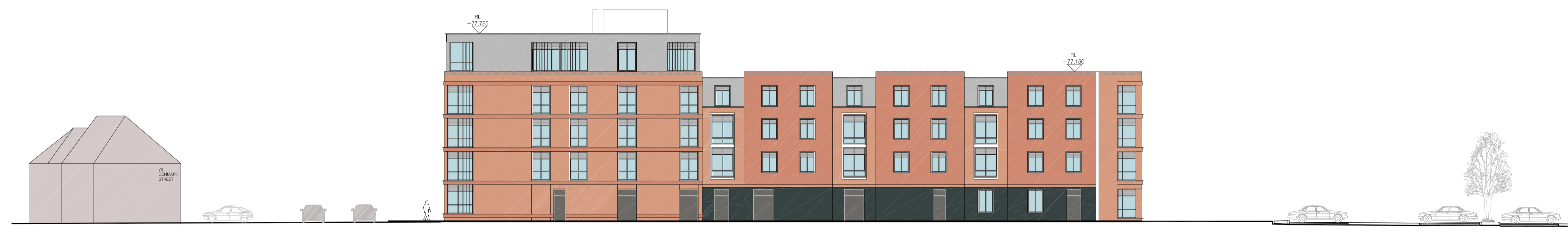
NORTH ELEVATION 2-2